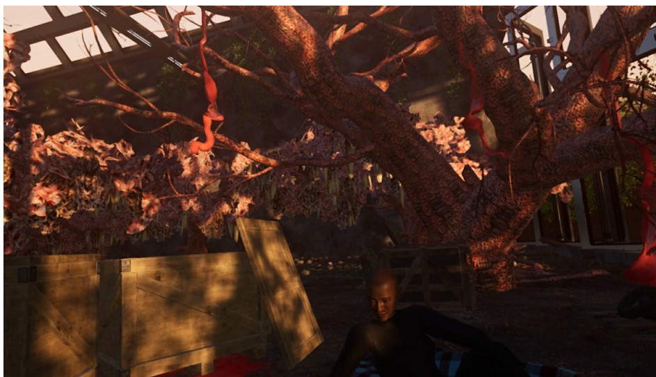
Meat Growers: A Love Story; 2019; Virtual Reality Work, 13:42; Made Possible by Rhizome and Tentacular; Animation: Pariah Interactive.

Yeah, it's really true. And I mean, I'm guilty of it. I guess we need to be more intentional about it.